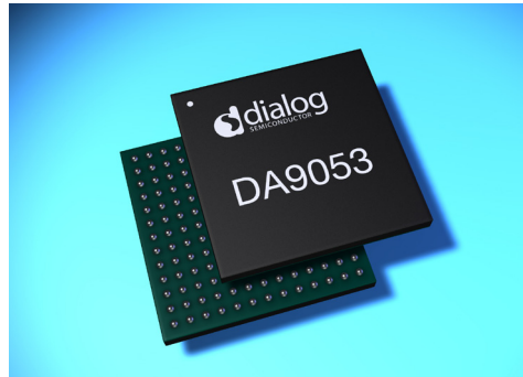
Available in VFBGA 7x7mm package VFBGA 11x11mm package (Consumer & Automotive grades)

For optimal processor energy-per-task performance dynamic voltage scaling is permissible on up to five supply domains. Dialog's patented Smart Mirror™ dynamic biasing is implemented on all linear regulators.