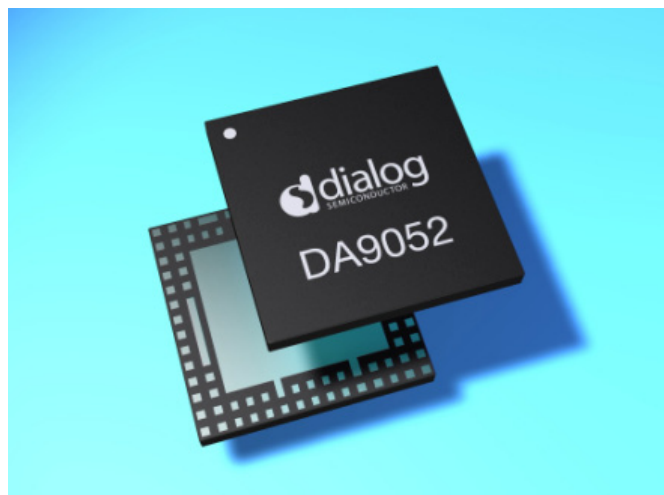
Available in an 86LD UFNBA-QFN 7x7mm package